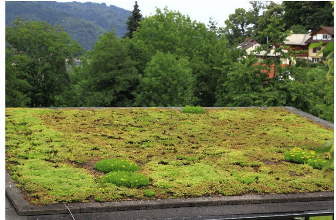
Green roofs provide an opportunity to utilize traditionally unused spaces for stormwater management

Design engineers can apply green roofs to new construction or retrofit them onto existing residential, commercial and industrial buildings. Many cities, such as Chicago and the District of Columbia, actively encourage green roof construction to reduce stormwater discharges and CSOs. Other municipalities encourage green roof development with tax credits, density credits or grants. In