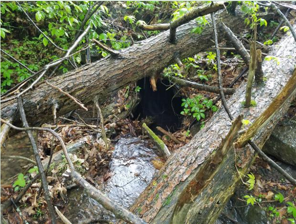
Culvert obstructed with woody material

In these cases, it may be necessary to remove part or all of the woody material to alleviate the problem, ultimately removing or altering only what is necessary to reduce the risk.