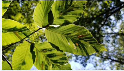
Early Beech Leaf Disease